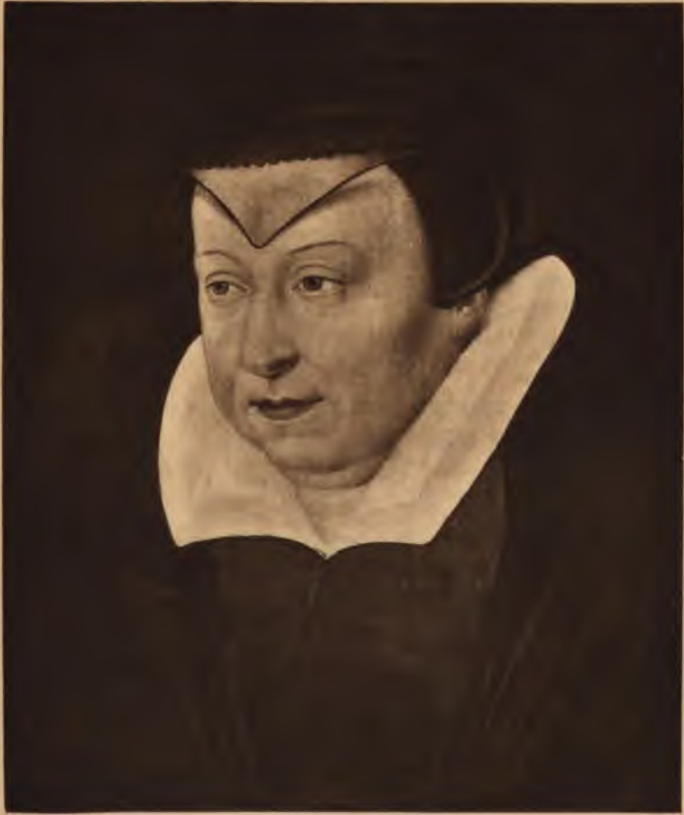
Catherine de' Medici